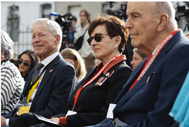
Sir Lockwood Smith, Dame Patsy Reddy, Sir David Gascoigne