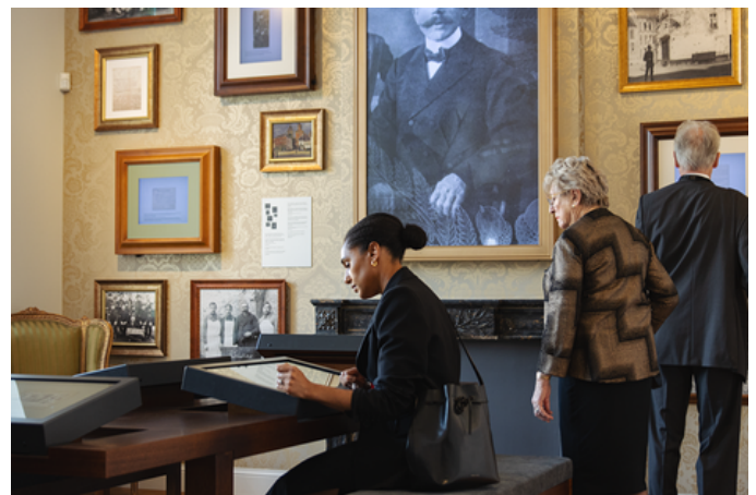
He Tangata Room - Stories of the people