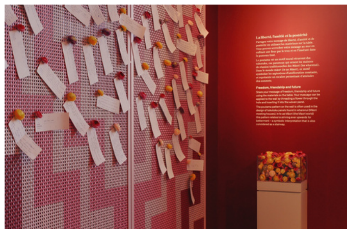
Te Ara Tuku - The Message Room