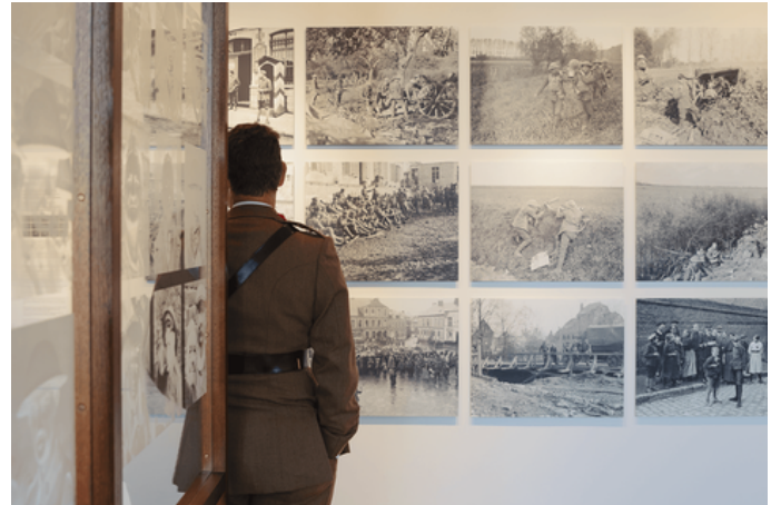
The Room of Views - The Photography of Henry Armytage Sanders