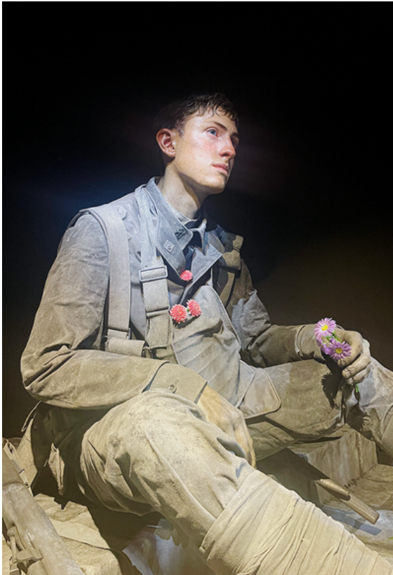
The Encounter Room