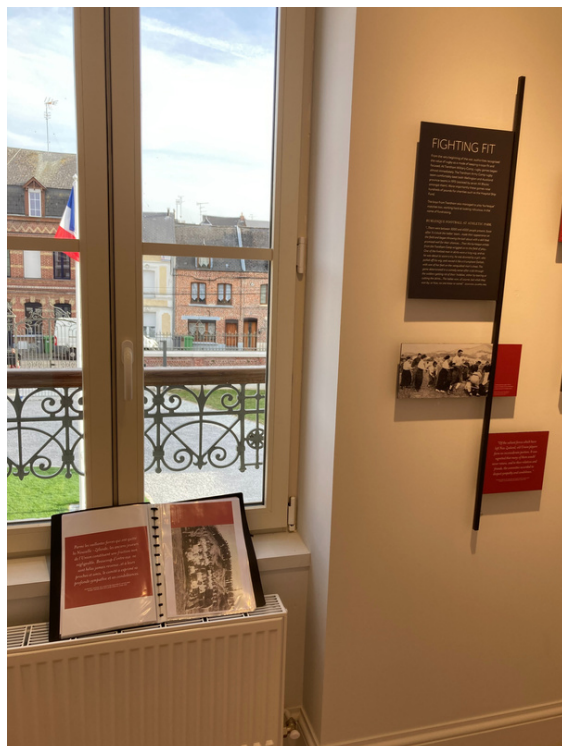
From the Field to the Front - The Rugby Exhibition