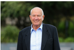
Sir Don McKinnon - Chair New Zealand Memorial Museum Trust - Le Quesnoy